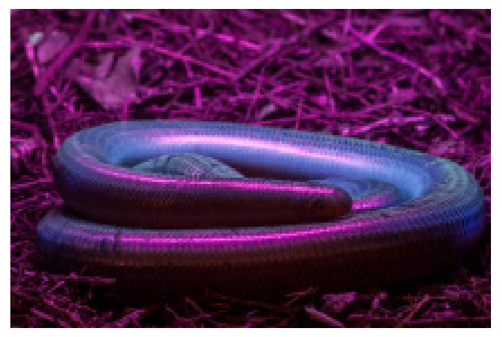
Figure 2. Anilios proximus, Beechmont, Queensland (Image lit with UV emitting LED torch) S. Eipper

22:17 AEST using only an ultraviolet emitting LED torch as the light source (See figures 1 and 2) weather and habitat conditions were not recorded.