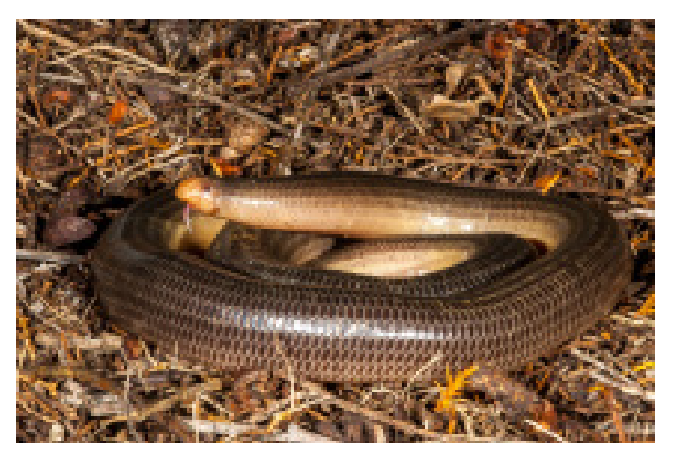
Figure 1. Anilios proximus, Beechmont, Queensland (Image lit with flash) S. Eipper

On 16 December 2008 at 20:40 AEST, one of the authors (S.E) found a road killed A. proximus from Beechmont, Queensland which also exhibited limited fluorescence. A live specimen from Beechmont, Queensland was seen and photographed that night at